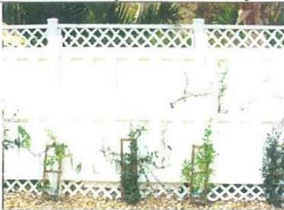
(4) 5 foot Shadow Box Fence w/ Lattice Top & Gothic Caps