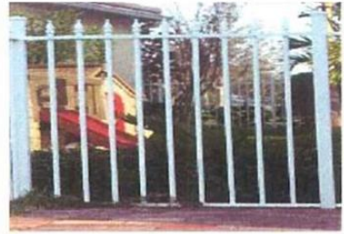
(3) 4 foot Aluminum Open Picket w/Gothic Caps