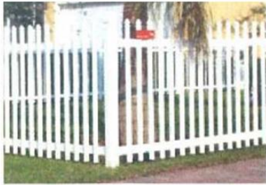
(2) 4 foot Vinyl Open Picket with Gothic Caps