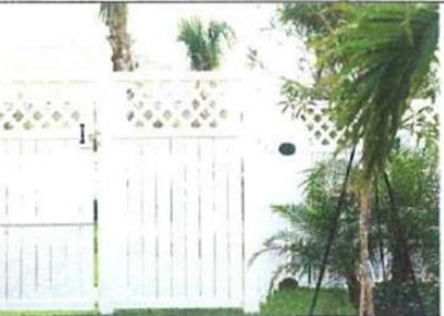
(6) 5 foot Privacy Fence 1/2" space between Panels w/ Lattice Top & Gothic Caps