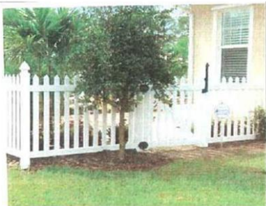
(7) 4 foot Picket Fence, 3" posts spaced 3" apart w/Gothic Caps