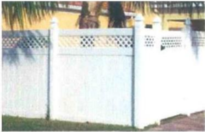
(1) 5 foot Standard Privacy w/ Lattice Top & Gothic Caps