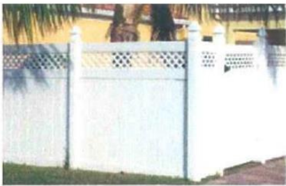
(1) 5 foot Standard Privacy w/ Lattice Top & Gothic Caps