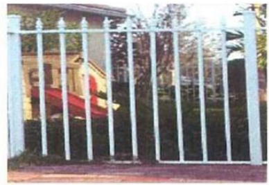
(3) 4 foot Aluminum Open Picket w/Gothic Caps