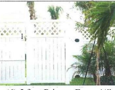
(6) 5 foot Privacy Fence 1/2" space between Panels w/ Lattice Top & Gothic Caps