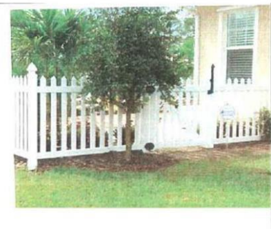
(7) 4 foot Picket Fence, 3" posts spaced 3" apart w/Gothic Caps